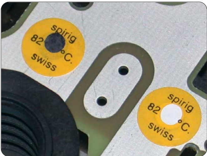
CelsiPoint ® with one 82°C level. CP on left side exceeded and on right side never exposed to or above 82°C.