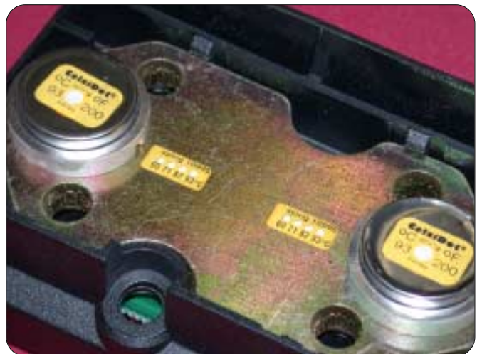
CelsiDot ® 's with 93°C level and MICRO-CelsiStrip ® s applied to an automotive electronic control before life test.

e - s h o p - - - > w w w . c e l s i . c o m