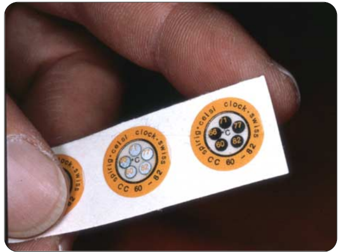
CelsiClock ® with 5 temperature levels. CelsiClock ® 's are also available with other temperature values and arrangements.