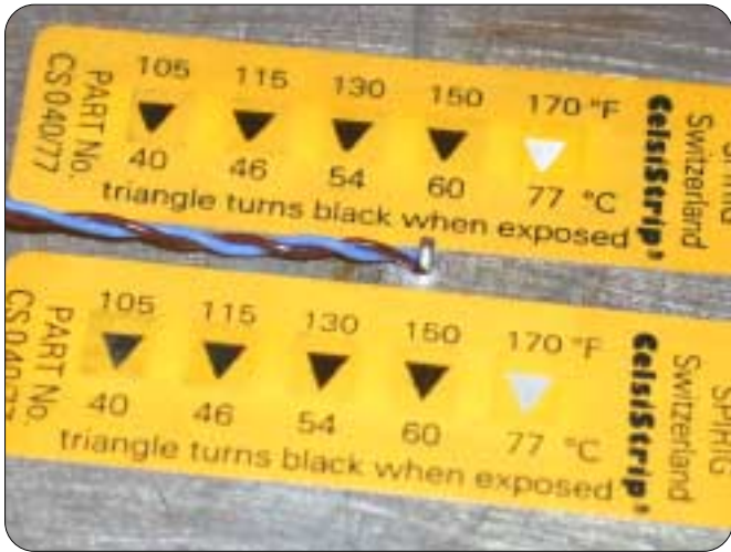
CelsiStrip ® with 5 temperature levels. Also 8 levels (not shown here) available. Here 60°C are exceeded but 77°C never reached.

Apply and Forget! irreversible temperature level recording labels. Self-adhesive, easy applicable on any surface. Forty levels to choose from +40°C (105F) to +260°C (550F) and arranged in various combinations. Accuracy ±1,5%. Permanent blackening of the original white level clearly indicates that level had been exceeded.